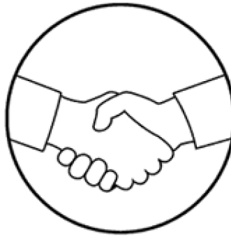
Ujima Collective Work & Responsibility